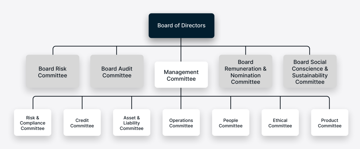
Figure 1 Governance structure

The Board Risk Committee, the Board Audit Committee, the Board Remuneration & Nomination Committee and the Board Social Conscience & Sustainability Committee are all sub-committees of the Board.